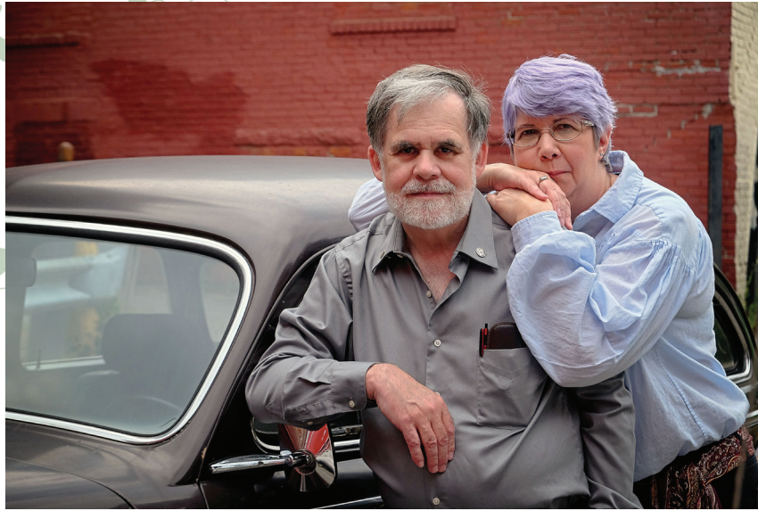
Award-winning authors of the Liaden Universe®